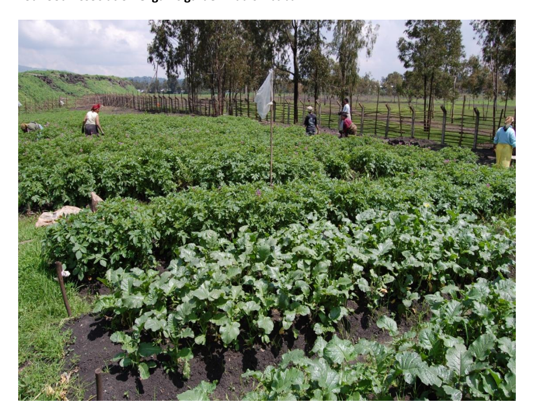
Figure 3. Vegetable to be harvested (Photo: AW, June, 2016)